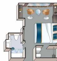
Suite (284 sq ft)